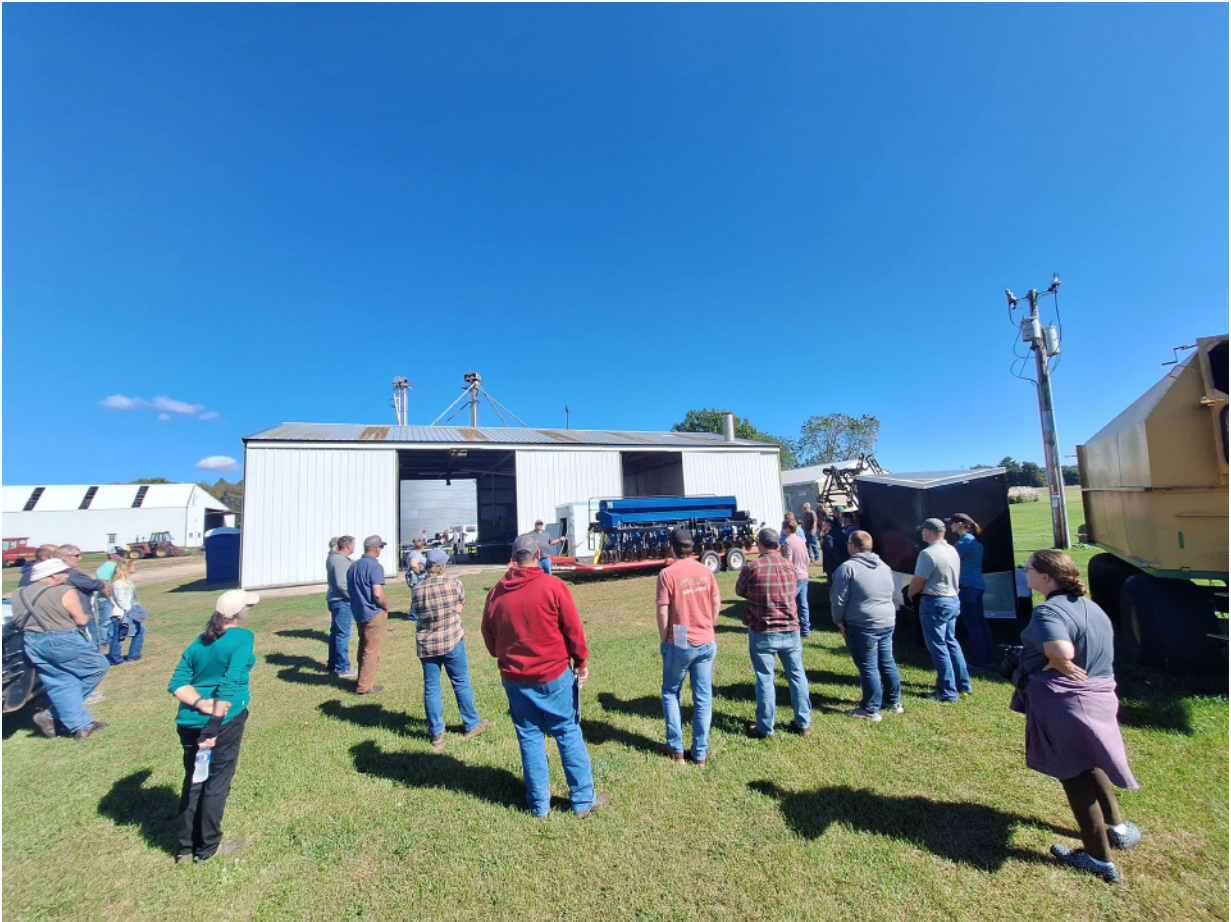
Soil Health Field Day Attendees