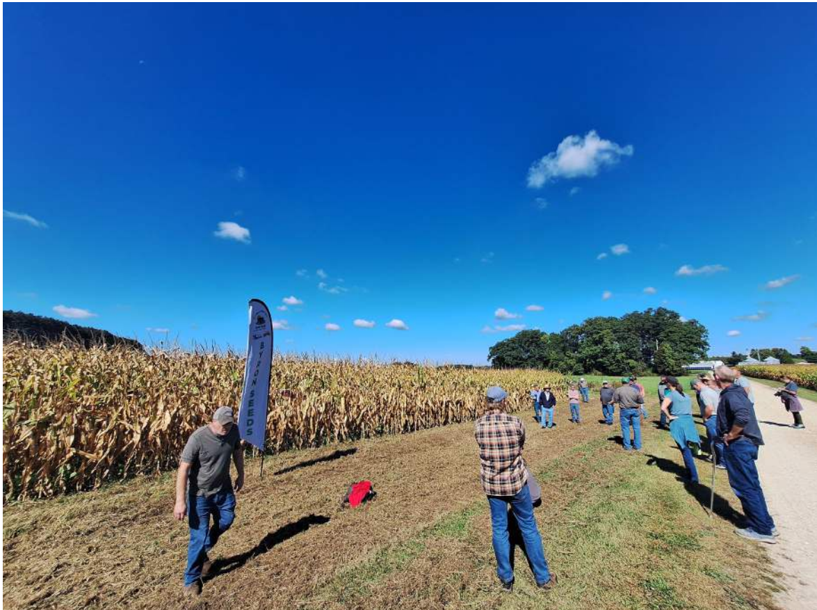
Soil Health Day Field Walk to view Interseeded Cover Crops.